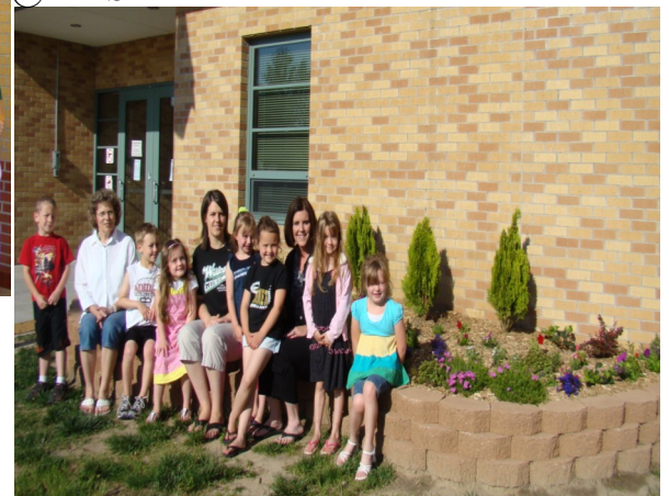
Kindergarten Service Learning Project @ MPS