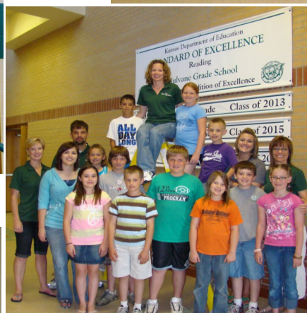
MGS Received Standard of Excellence